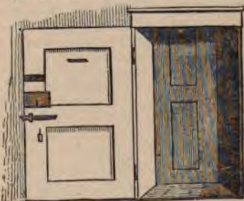
A "Sporting Door," or "Oak."

Oak , the outer door of college rooms; to "sport one's OAK," to be "not at home" to visitors. See SPORT.— University.